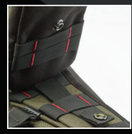
10 UNIVERSAL MOLLE® ATTACHMENT SYSTEM