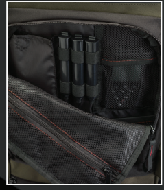
5 FRONT ZIP POCKET FOR ACCESSORIES