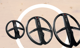
X35 Coils 4 - 8 - 12 - 18 - 25 kHz + shifts