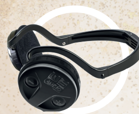
WS AUDIO headphones