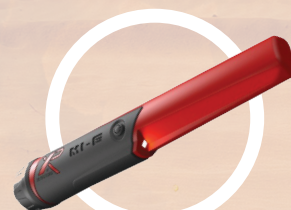
Pinpointer MI-6 connected