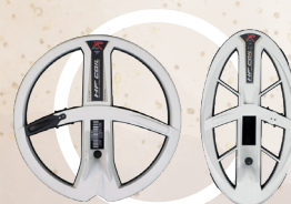
HF Coils 22cm / 9" HF COIL : 15 / 28 / 54 kHz + shift Elliptical HF COIL : 15 / 28 / 80 kHz + shift