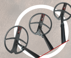
FMF® Coils 34/28 - 28 - 22