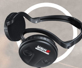
WSA II Headphones