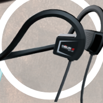
BH-01 Bone conduction headphones