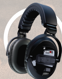
WSA II XL Headphones