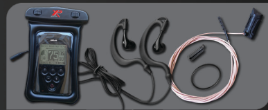
Kit: waterproof armband 5m + Aerial antenna (available in 1m15 or 2m50)