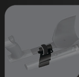
MI-4 / MI-6 Stem Support