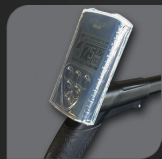
Protective silicone case