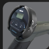
WS4 Stem Support