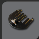
WS4 clip jack adaptor